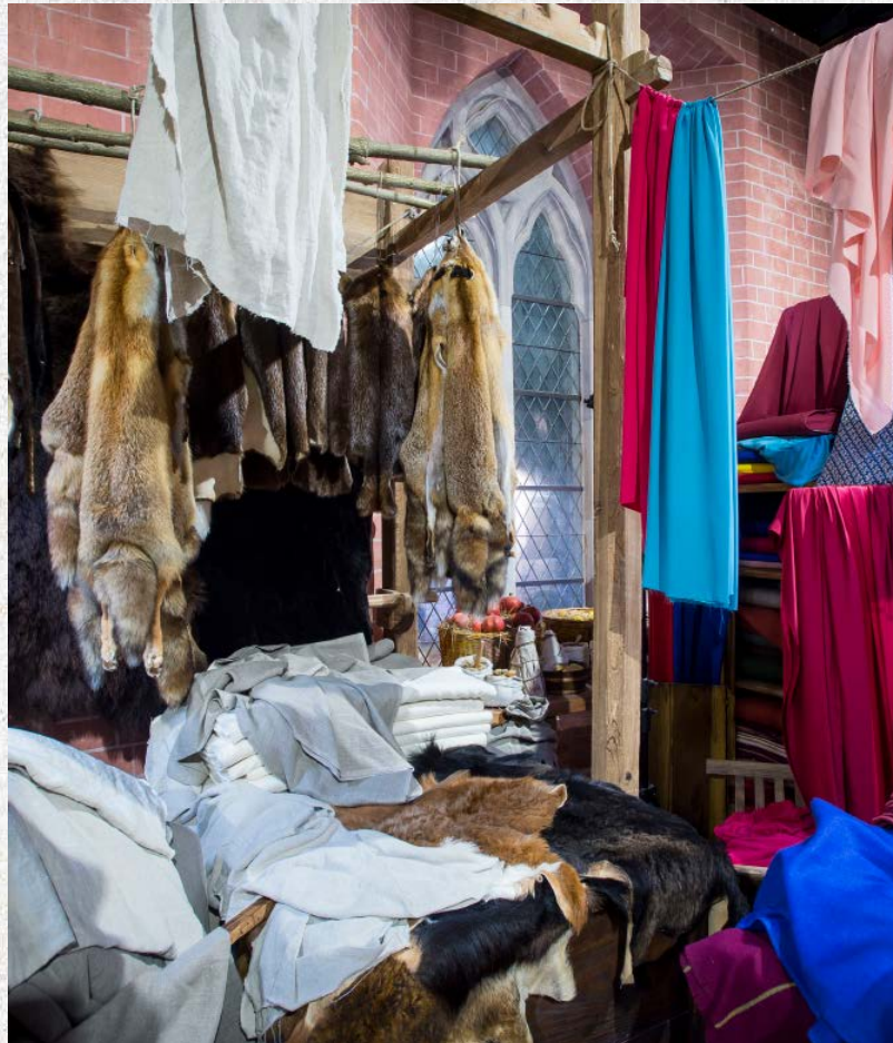
◀ Trading was conducted with goods that were typically regional, and sometimes with luxury goods: for example, wax and furs from Novgorod, cloth, silver, metal goods, salt, herrings and grain from Hanseatic cities such as Lübeck, Münster or Dortmund

Merchants, who often shared family ties to each other, were not always fair to producers and craftsmen. There is ample evidence of routine fraud and young traders in far-flung posts who led dissolute lives. It has also been proven that slave labor was used.